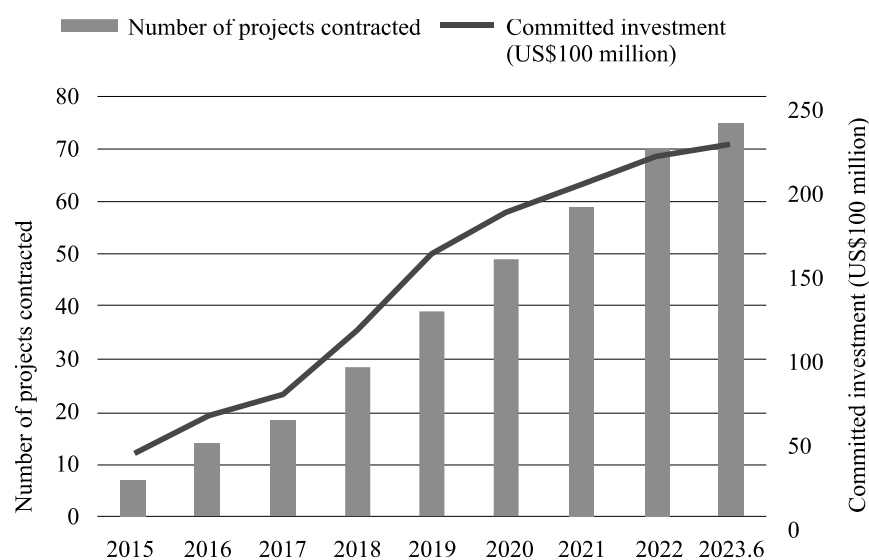
Figure 3: Number of projects contracted and committed investment by the Silk Road Fund since 2015

The CDB and the Export-Import Bank of China (China Eximbank) have each set up special loans for the BRI to pool resources to increase financing support for BRI cooperation. By the end of 2022, the CDB has provided direct high-quality financial services for more than 1,300 BRI projects, playing a leading role in guiding development finance, and pooling all kinds of domestic and foreign funds for BRI cooperation. The balance of loans of China Eximbank for BRI projects reached RMB2.2 trillion, covering 130-plus participating countries and driving more than US$400 billion of investment and more than US$2 trillion of trade. China Export & Credit Insurance Corporation has fully applied export credit insurance and actively provided comprehensive guarantees for building the Belt and Road.